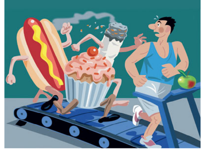
Illustration by Stephen Jeffrey

EVERY day there are new stories in the tabloids about the latest link, sometimes tenuous, sometimes contradictory, between cancer and some aspect of lifestyle. If this is a recipe for confusion, then the antidote is probably a weighty new tome from the World Cancer Research Fund (WCRF). It is the most rigorous study so far on the links between food, physical activity and cancer – and sets out the important sources of risk.